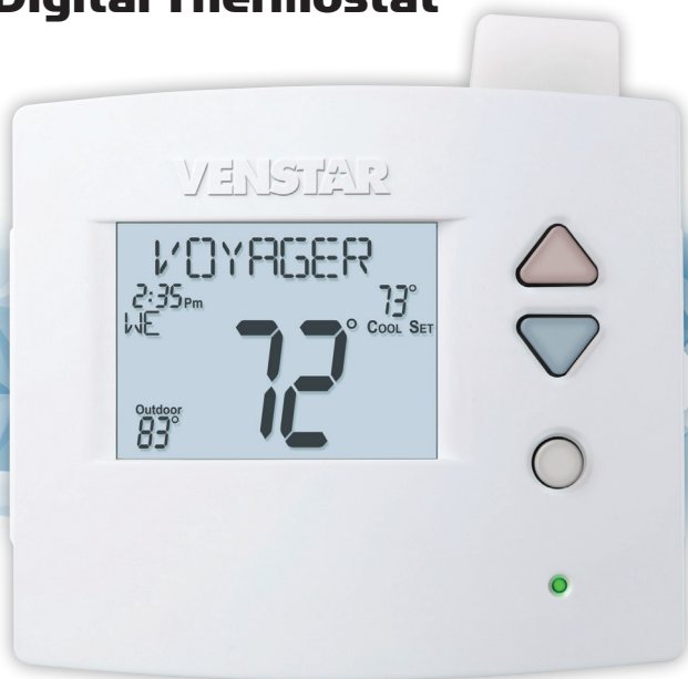
4.6" w x 5.2" h x 1.1" d

Accessories: ACC-0625 Lock Ring, ACC-0425 Wall Plate, and the wireless modules below.